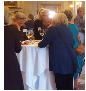
Old friends and colleagues gather for the fall reception at the Faculty Club.