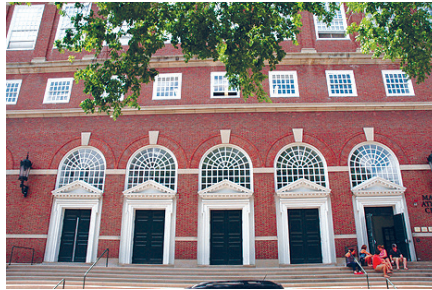
Malkin Athletic Center—the MAC

Retirees with valid Harvard ID cards have free access to all of these facilities. They can also use the tennis courts and the squash courts at the same additional rates charged to active faculty and staff.