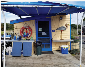
Essex River Cruise Headquarters. See more photos on page 4.