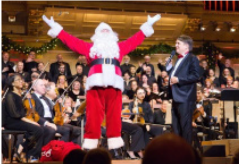
Join Keith Lockhart and Santa Claus at one of Boston's iconic holiday events.

Saturday, December 14, 2024, 3:00 p.m., Boston Symphony Hall