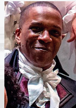
Leslie Odom, Jr.

If demand is heavy, we will limit to one guest only.