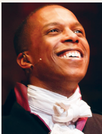
Leslie Odom, Jr.

8:00 p.m. Boston Pops with Leslie Odom, Jr., who portrayed Aaron Burr in the hit Broadway show Hamilton . Registration information is elsewhere in this issue.