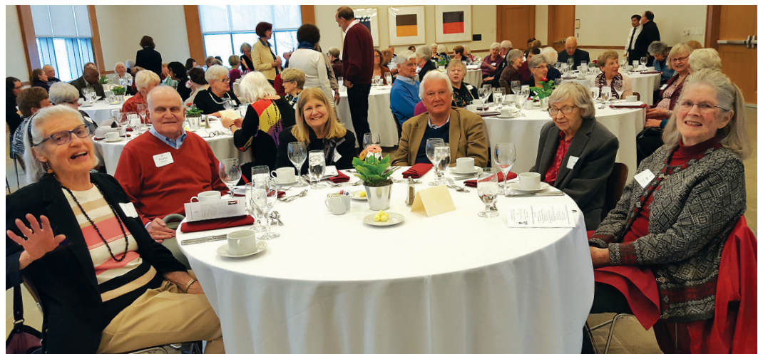
Board members at the Annual Meeting

She didn't speculate on whether the stolen paintings would be found, but believes they are not still together. She assured the audience that if any are found, there is a recovery plan in place to conserve them properly before restoring them where Mrs. Gardner had placed them in the museum.