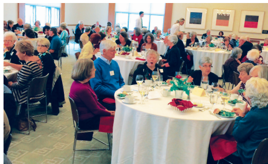
The Wasserstein Hall provides a pleasant venue for a luncheon.