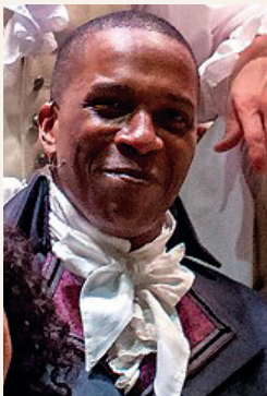
Leslie Odom, Jr.

June 6, Tuesday, 8:00 p.m. Boston Pops with Leslie Odom, Jr., who portrayed Aaron Burr in the hit Broadway show Hamilton . Registration information will be in the May/ June HURA News and by E-List.